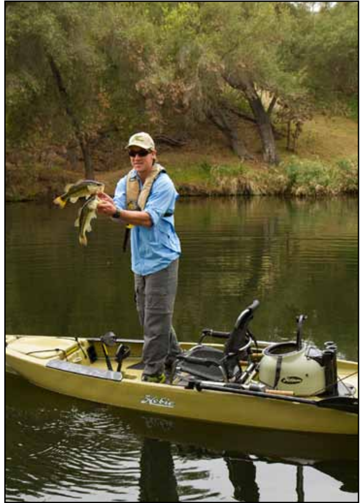
The Hobie Mirage Pro Angler 12, winner of the prestigious ICAST Best of Show, is selling as fast as it can be produced, a reflection of Hobie's passion for shaping a unique lifestyle around fun, water and quality products.