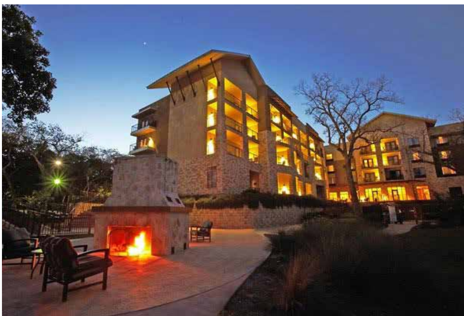
The Courtyard by Marriott in New Braunfels has added some great outdoor amenities to enhance its riverside backyard.