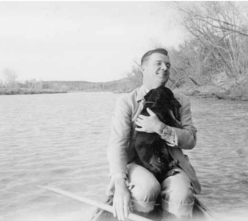
John Graves in his canoe on the Brazos with his six-month old dachshund Watty, a.k.a. "The Passenger," on the Brazos River in 1957.

Across the nation, from the New York Times to the Los Angeles Times and with a legion of newspapers, magazines, blogs and Facebook posts in harmonic chorus in-between, the nation joins with Texas in an outpouring of grief and appreciation following the death of Lone Star luminary John Graves who died at his beloved Hard Scrabble home during the night of July 30, 2013. John was 92.